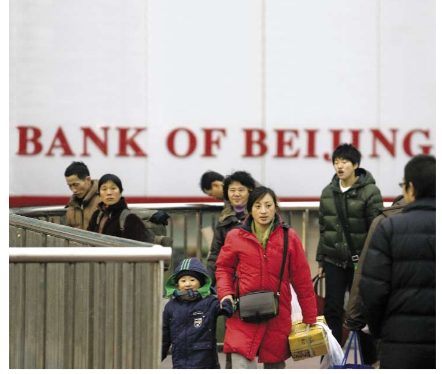
Working simultaneously with China's government and banks, IFC is helping make green banking a reality in the world's largest emerging market.

Among the smaller banks, one of the most actively engaged was our client Industrial Bank, which in October 2008 became the first Chinese bank to adopt the Equator Principles and was recently recognized by the Financial Times with a regional Sustainable Banking Award. Another IFC client, Bank of Beijing, is now actively moving in this same direction. The successful model of China-IFC cooperation is also being expanded within the region as IFC is entering into similar partnerships with Vietnam and Bangladesh and actively facilitating the South-to-South cooperation to build on China's expertise and experience.