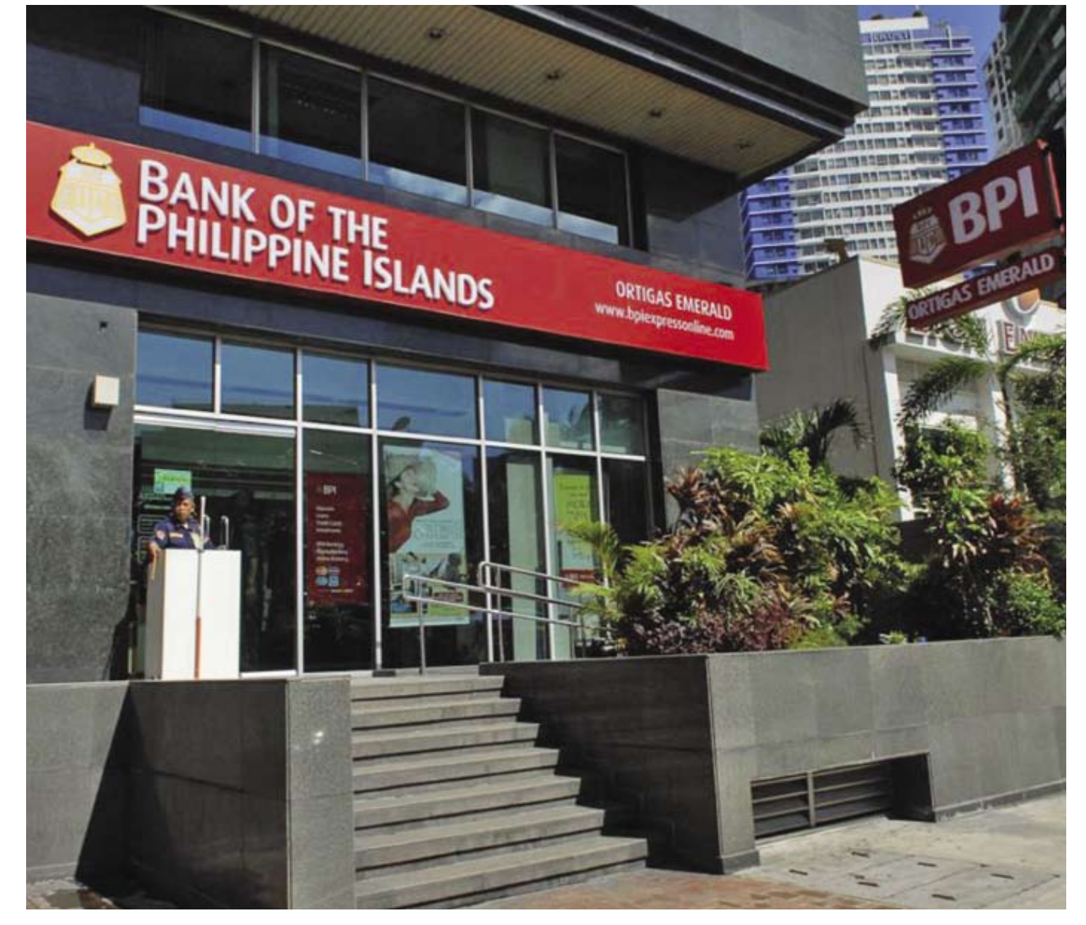
Bank of the Philippine Islands (BPI): One of the country's leading banks, and IFC's partner in sustainable energy financing.

All told, IFC had energy efficiency programs in 12 countries as of June 2009 that were avoiding 6.5 million tons of carbon dioxide emissions annually, the equivalent of closing down a 1,000 megawatt coal plant.