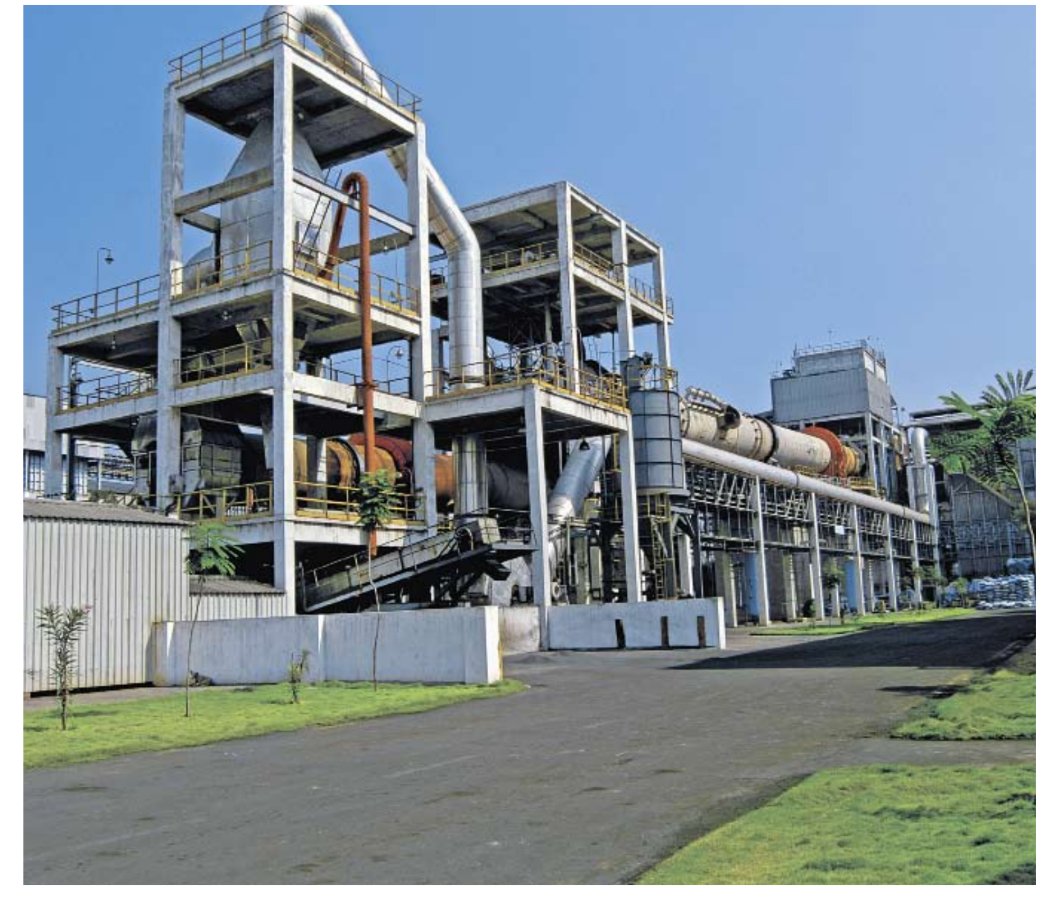
Industrial clients in emerging markets like India's Rain CII Carbon (above) gain improved access to the global carbon finance market through IFC's Carbon Delivery Guarantee product.

Carbon finance is an integral part of IFC's climate change strategy. Several other Carbon Delivery Guarantee and other structured transactions are being pursued throughout the developing world.