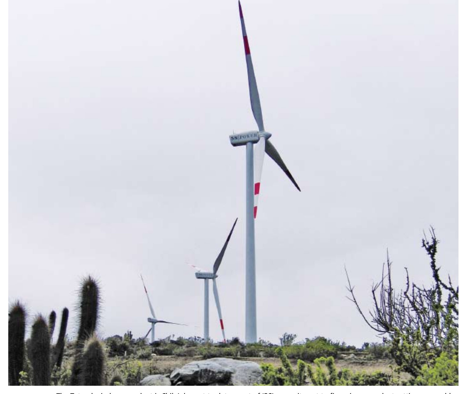
The Totoral wind power plant is Chile's largest to date—part of IFC's commitment to financing precedent-setting renewable energy transactions across the developing world.

Such breakthroughs are needed to change the global power mix and usher in a low-carbon future. Sometimes donor subsidies can help start the process. In 2004, private Philippine utility CEPALCO opened what at the time was the developing world's largest grid-connected solar photovoltaic power plant, one with 6,500 panels on the island of Mindanao. It was done with a $4 million Global Environment Facility grant that IFC arranged and structured. We have since begun scaling up our solar investments, part of our drive to move the power sector forward with greater use of clean, affordable renewable energy.