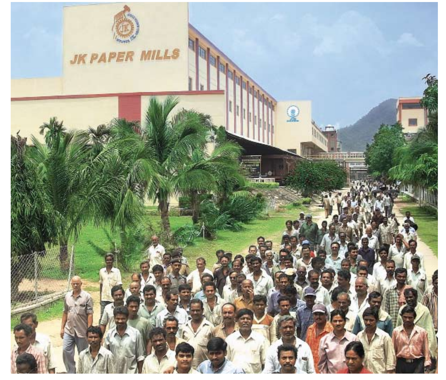
Large-scale manufacturers like India's JK Paper work with IFC to save energy and cut costs.

We started the Cleaner Production work with a $20 million global lending pool that helped JK and six other clients cut costs through climate-friendly environmental measures. Now the initiative is being expanded to $125 million to enable us to help more clients. It builds an even stronger case that these upgrades are good for business as well as the environment.