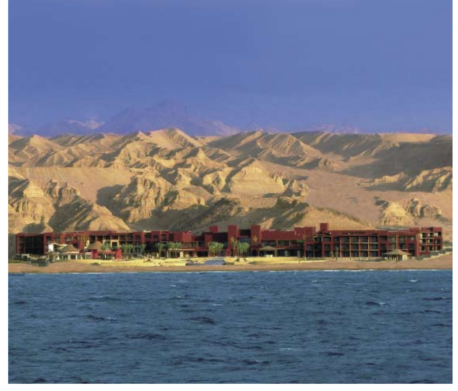
Zara Investment Holdings' new beach resort at Tala Bay in Aqaba, Jordan has created 500 jobs. By 2011 it will generate $11 million in local procurement, mainly from small businesses. After financing its opening in 2008, IFC followed with additional support for cost-saving environmental measures.

Tourism: One of the world's largest industries