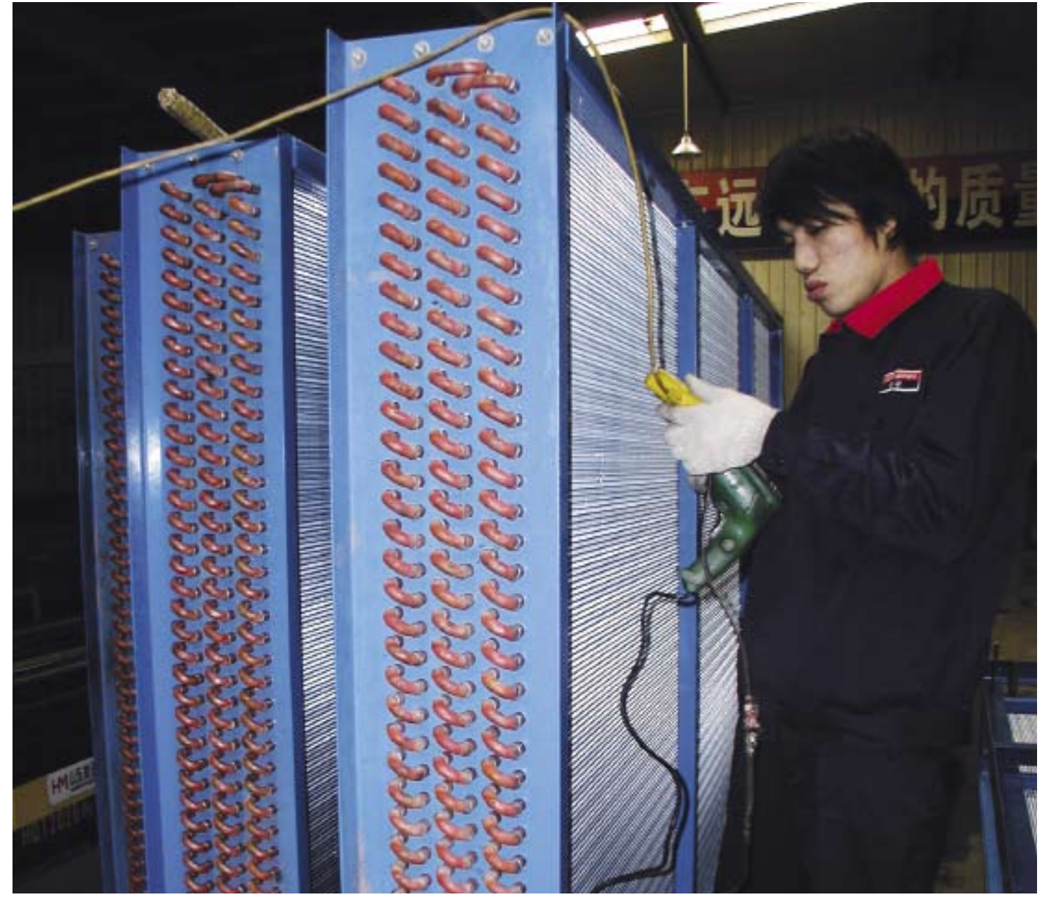
Shouren Energy High-Tech Co.'s dehumidifying technology helps Chinese steel producers reduce their energy use.

The steel industry is the biggest user of energy in China. To help it do more with less, we have just committed an $8 million equity/quasi-equity investment in Shouren Energy High-Tech Co., a local firm whose dehumidifying systems help blast furnaces reduce coal usage and carbon emissions. Founded by graduates of China's leading technology university, in time it too may become a game-changer.