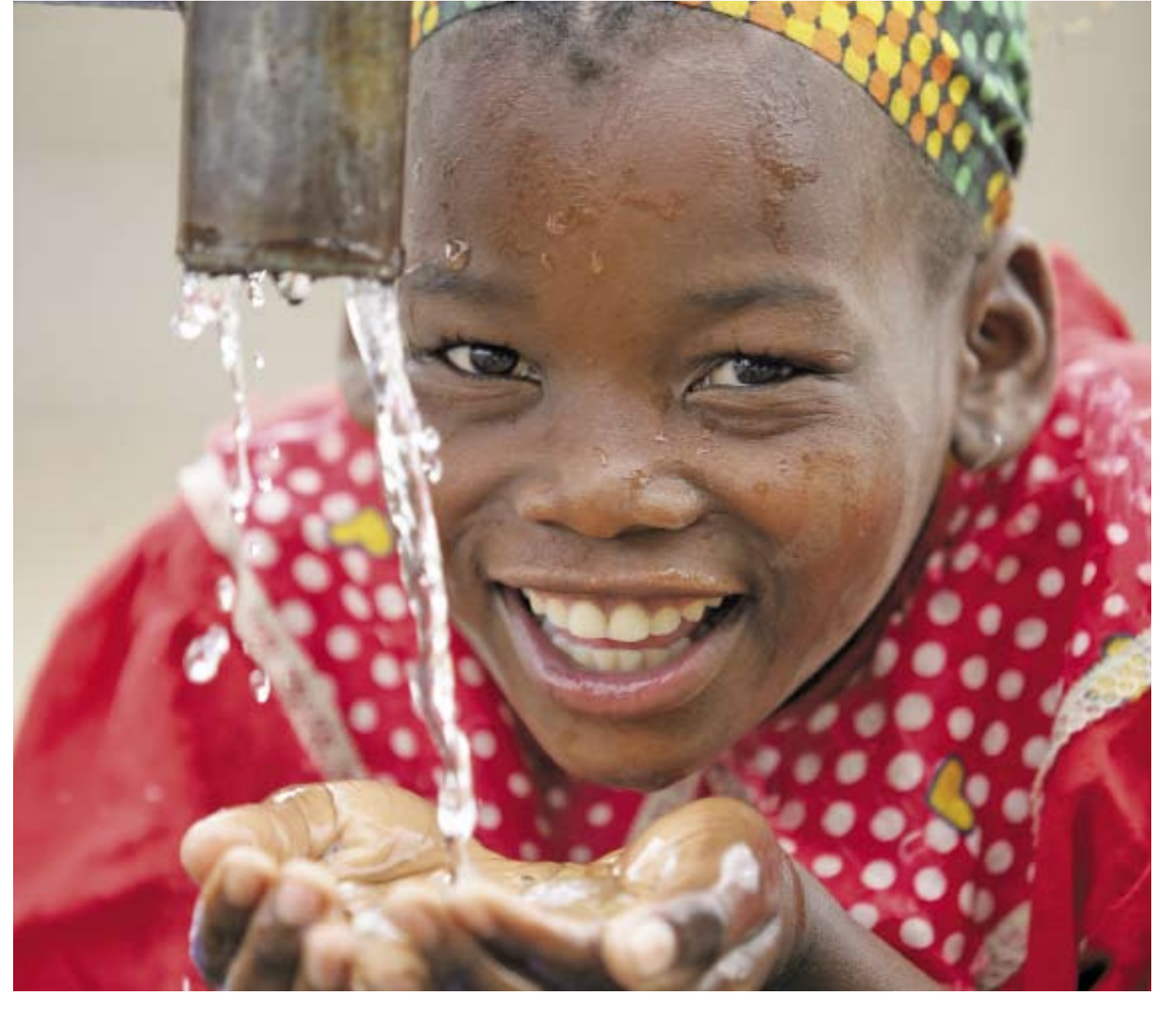
Looming issues of water scarcity require a new, more integrated approach than has been used until now. The private sector has an essential role to play.

The report is a starting point and will be widely discussed in the coming months. Its goal: helping the world achieve global water security in 20 years.