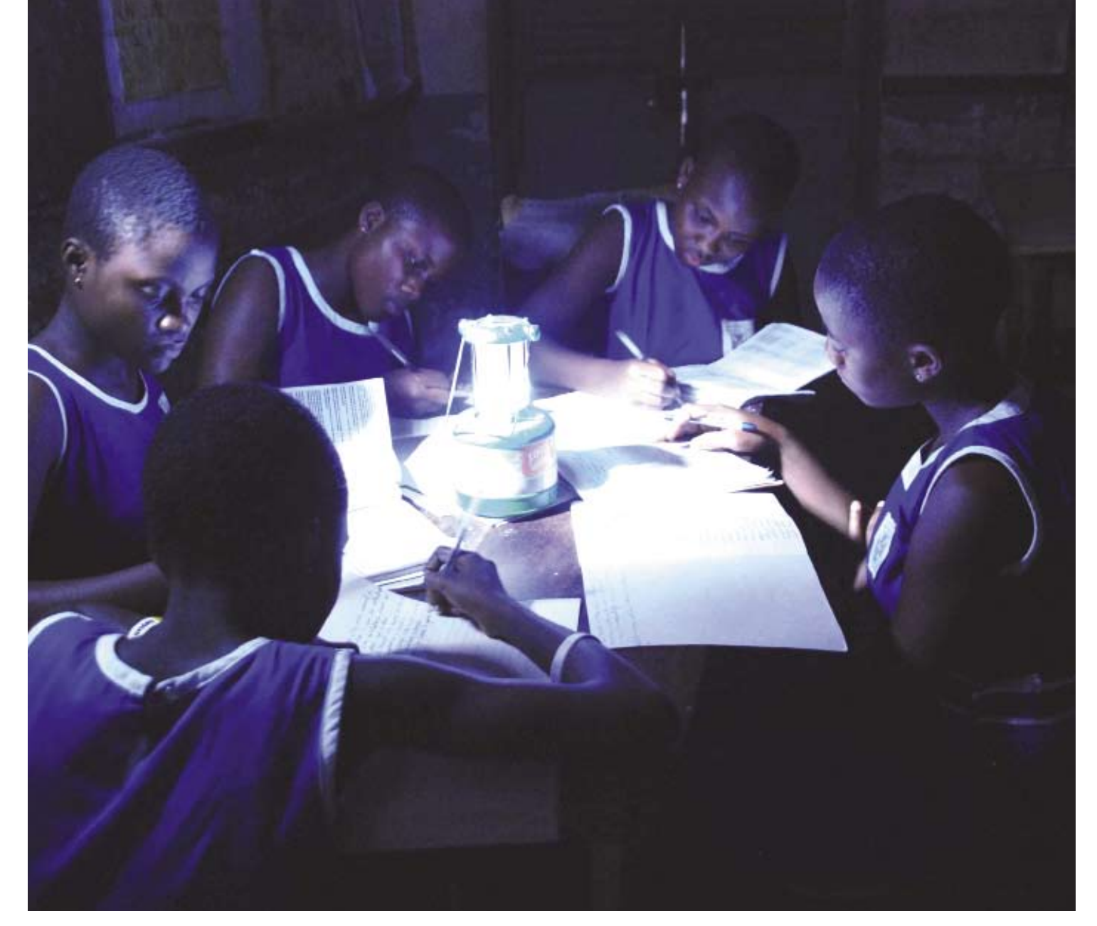
Affordable, high-efficiency lamps using light emitting diode (LED) technology give African children a better way to do schoolwork at night. Such advances lie at the heart of Lighting Africa, an IFC/World Bank initiative.

Lighting Africa: Building a market for high-efficiency lighting products in the world's poorest continent