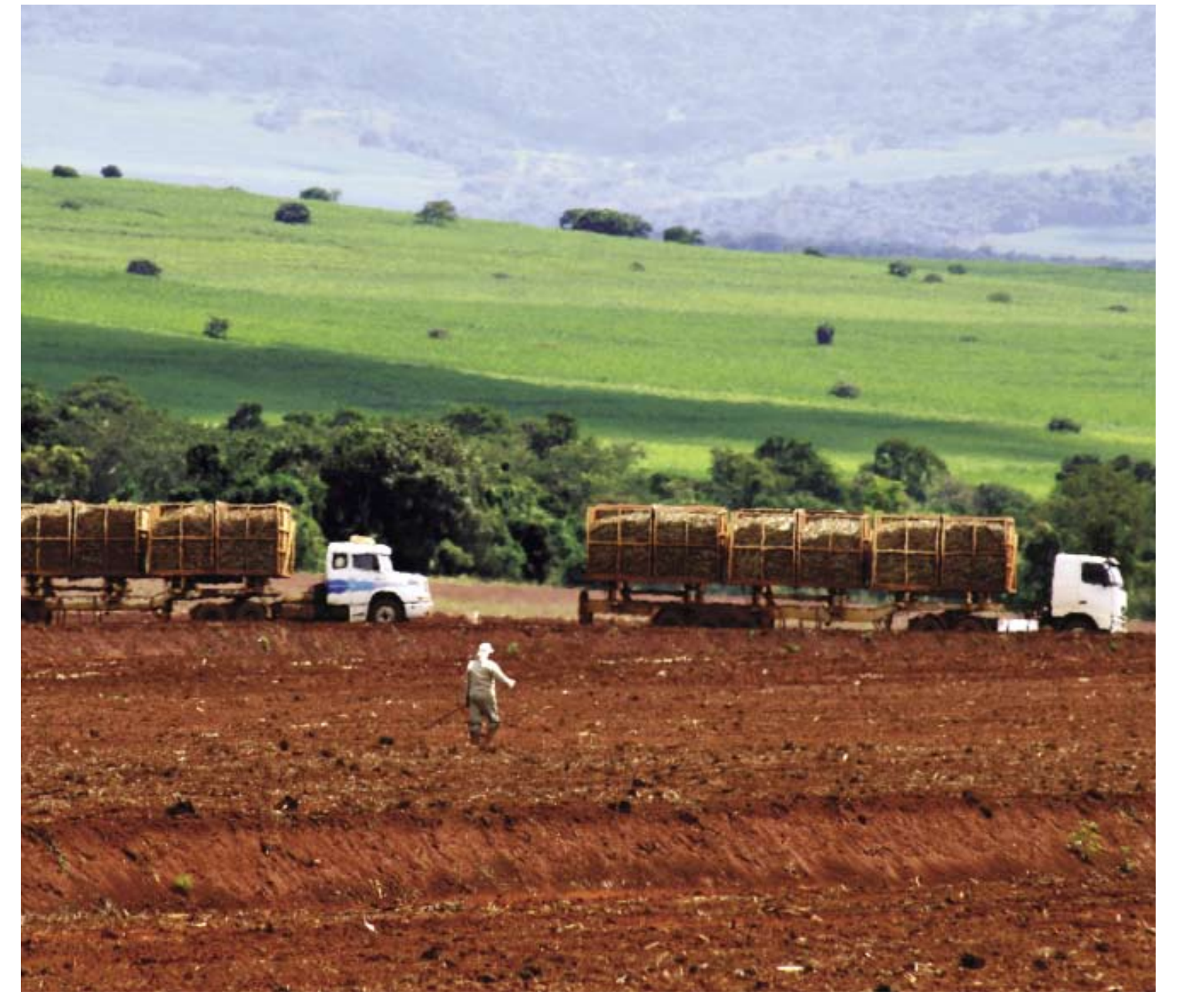
To support the world's shift to a more sustainable model of agricultural production, IFC participates in a series of commodity roundtables. The wide-ranging dialogue they conduct helps set new industry standards, making large-scale farming in the Brazilian sugar industry (above) and elsewhere around the world more climate-friendly.

This is a plus for palm oil-producing countries like Indonesia, where the crop has been a major employer, but also a major driver of deforestation contributing to climate change. Tree-cutting, peatland degradation, and forest fires have made Indonesia one of the world's top three emitters of greenhouse gases. There are no overnight solutions, but a more responsible palm oil industry is a big step in the right direction.